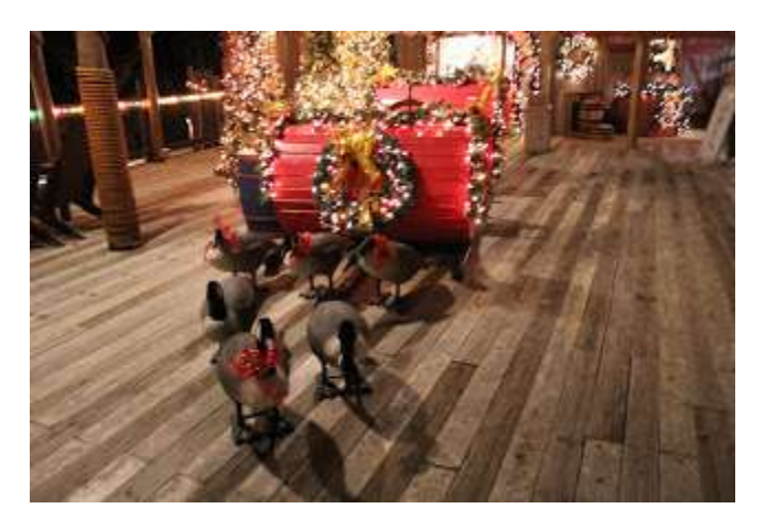
Christmas Sleigh at the Branson Belle Landing

The last three days were mostly driving on the bus with stops at Drury Inns in Terre Haute, Indiana and Troy, Michigan. At the Michigan Hotel we ran into a whole bunch of people who were staying at the hotel and were planing their Black Friday attacks on the consumer world. They were just a bit weird! We had dinner at noon at a Cracker Barrel. We had the turkey dinner special and we therefore had our second thanksgiving day! Turkey, ham dressing, gravy, cranberry sauce, green beans, sweet potato casserole, and biscuits.